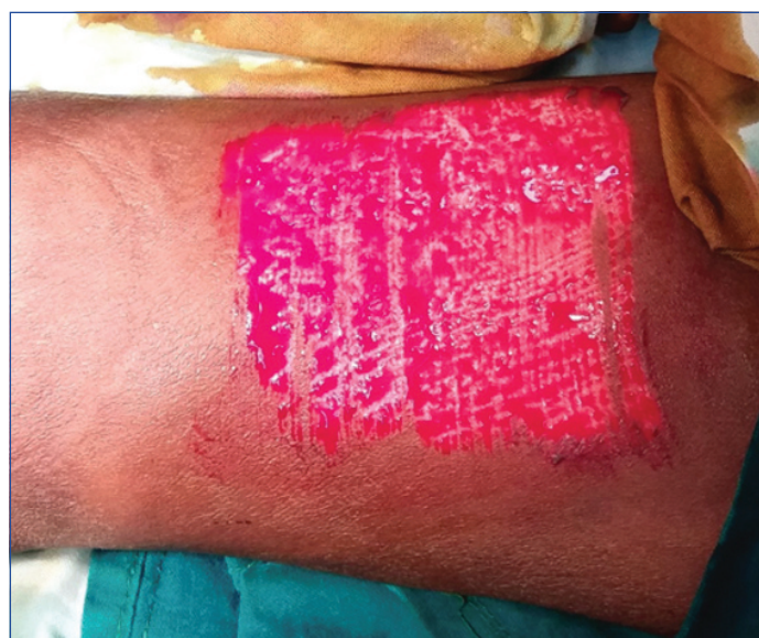
[Table/Fig-3]: Donor site, where no tumescent fluid was injected.

Non tumescent technique graft was taken without injecting a tumescent agent [Table/Fig-3]. In both groups, STSG was harvested using a humby (hand-held) knife. The grafts underwent manual meshing with an 11-number scalpel before being placed over the prepared recipient area. They were then affixed in position using sutures. The grafts were covered with burn mesh, and dressing was applied. Similarly, the donor area was also covered with burn mesh, and dressing was applied.