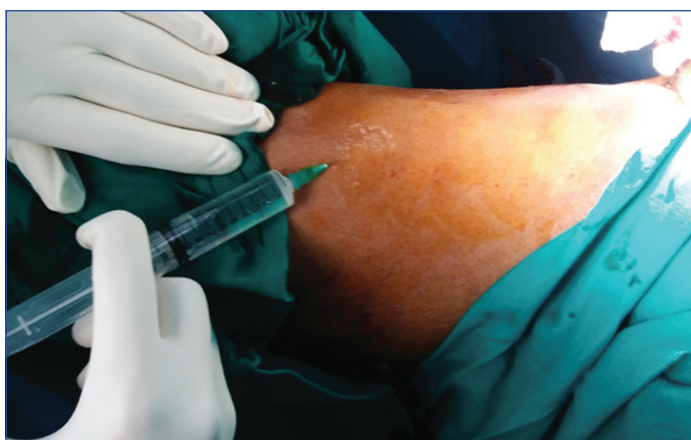
[Table/Fig-1]: Injection of tumescent fluid at the donor site.

Tumescent technique: Klein's formula containing 0.1% lidocaine, sodium bicarbonate 12.5 mEq (12.5 mL of 8.4% NaHCO 3 ), and 1:1 million adrenaline in 1 litre of saline was used and injected subcutaneously at the donor site [Table/Fig-1,2].